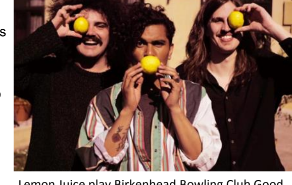
Lemon Juice play Birkenhead Bowling Club Good Friday Easter 10 April , non-members welcome.

BNH Men's and Women's Centre Fours, played 14 & 15 March, the draws and Conditions of Play are now available from BNH website.